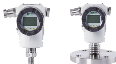
AT5020 Pressure Transmitter

Certification SIL2/3, NACE, NEPSI, ATEX, CE, PMI, EN10204