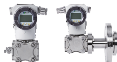
AT5010 Differential Pressure Transmitter

Certification SIL2/3, NACE, NEPSI, ATEX, CE, PMI, EN10204