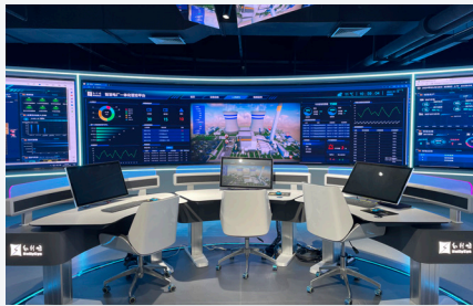
Exhibition Hall of Centralized Control Room