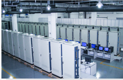
System Integration and Test Workshop