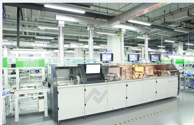
Automatic SMT Line