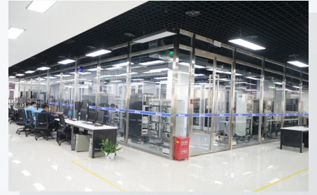
Simulation Test Centers