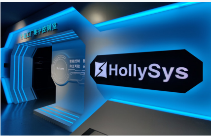
Centralized Control Room of Intelligent Plant