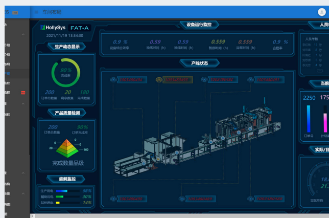
Intelligent Production Management System